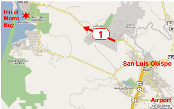
San Luis Obispo, Airport & Morro Bay