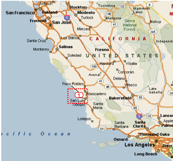
California Central Coast